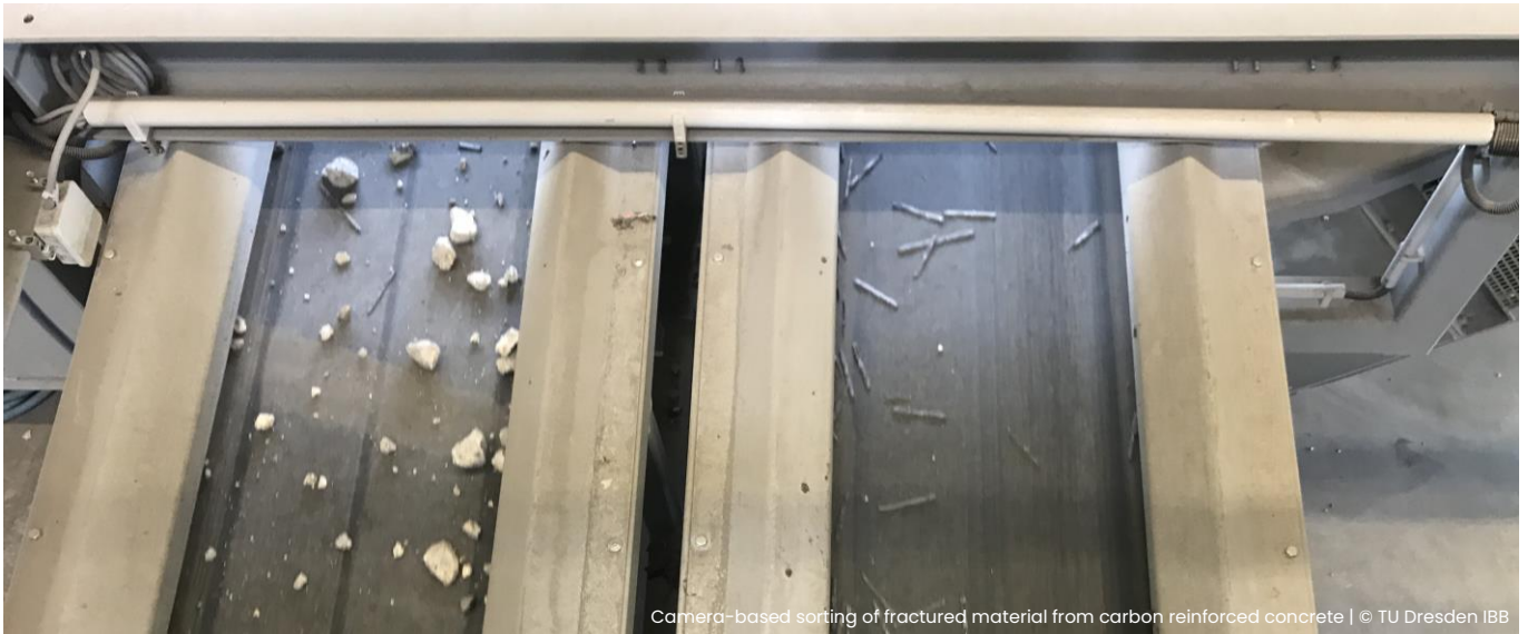
Camera-based sorting of fractured material from carbon reinforced concrete